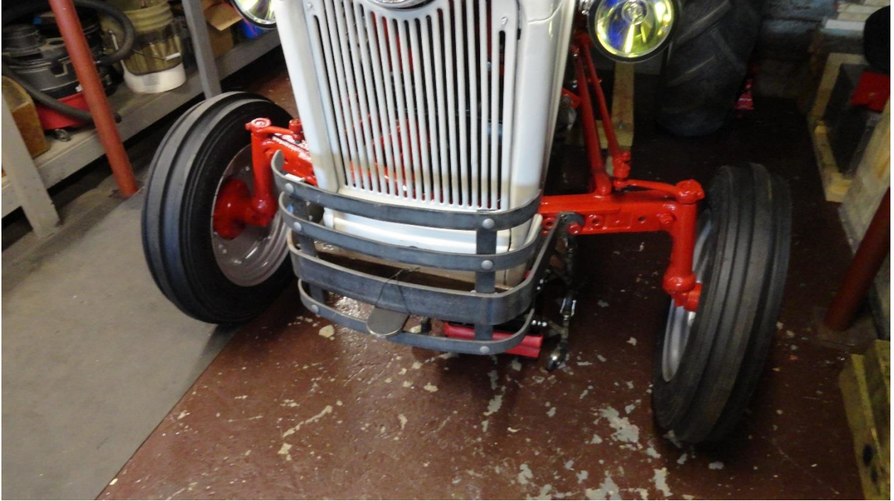
Paint- A bit of primer and paint and the bumper is complete.