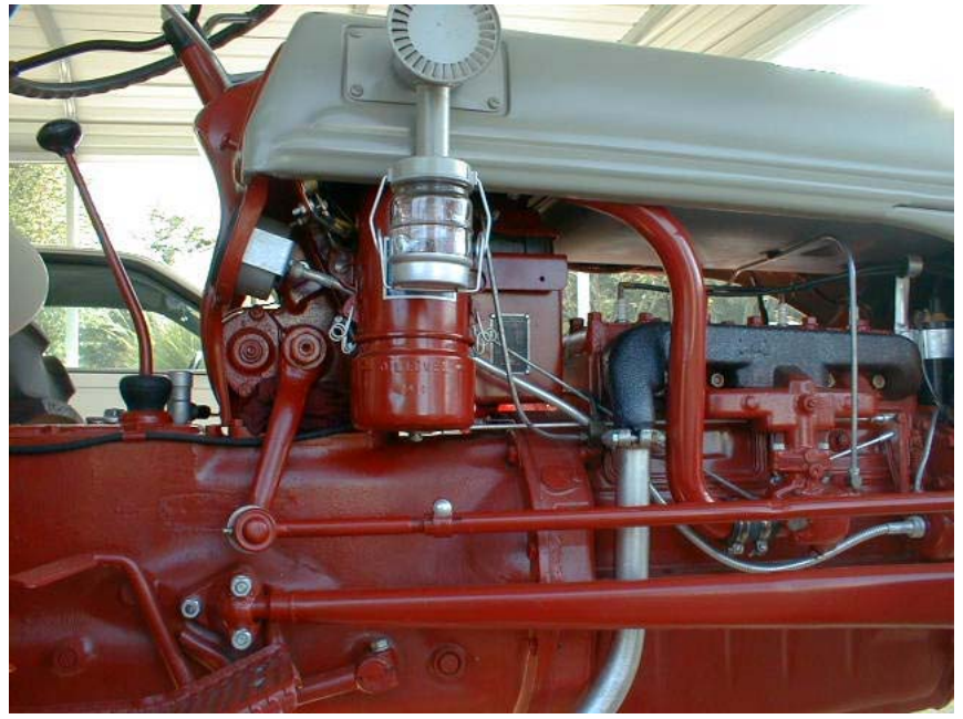
Decal is behind the glass jar on the canister.

FOR LONG ENGINE LIFE SERVICE OIL CUP DAILY. VERY DUSTY CONDITIONS TWICE DAILY. SERVICE BODY MONTHLY-REMOVE AND THOROUGHLY CLEAN WITH SOLVENT. VERY DUSTY CONDITIONS CLEAN MORE OFTEN. USE SAME GRADE OIL RECOMMENDED IN CRANKCASE KEEP INLET SCREEN & TUBE CLEAN AND FREE OF OIL. KEEP HOSE CONNECTIONS TIGHT. REFER TO OWNERS MANUAL.