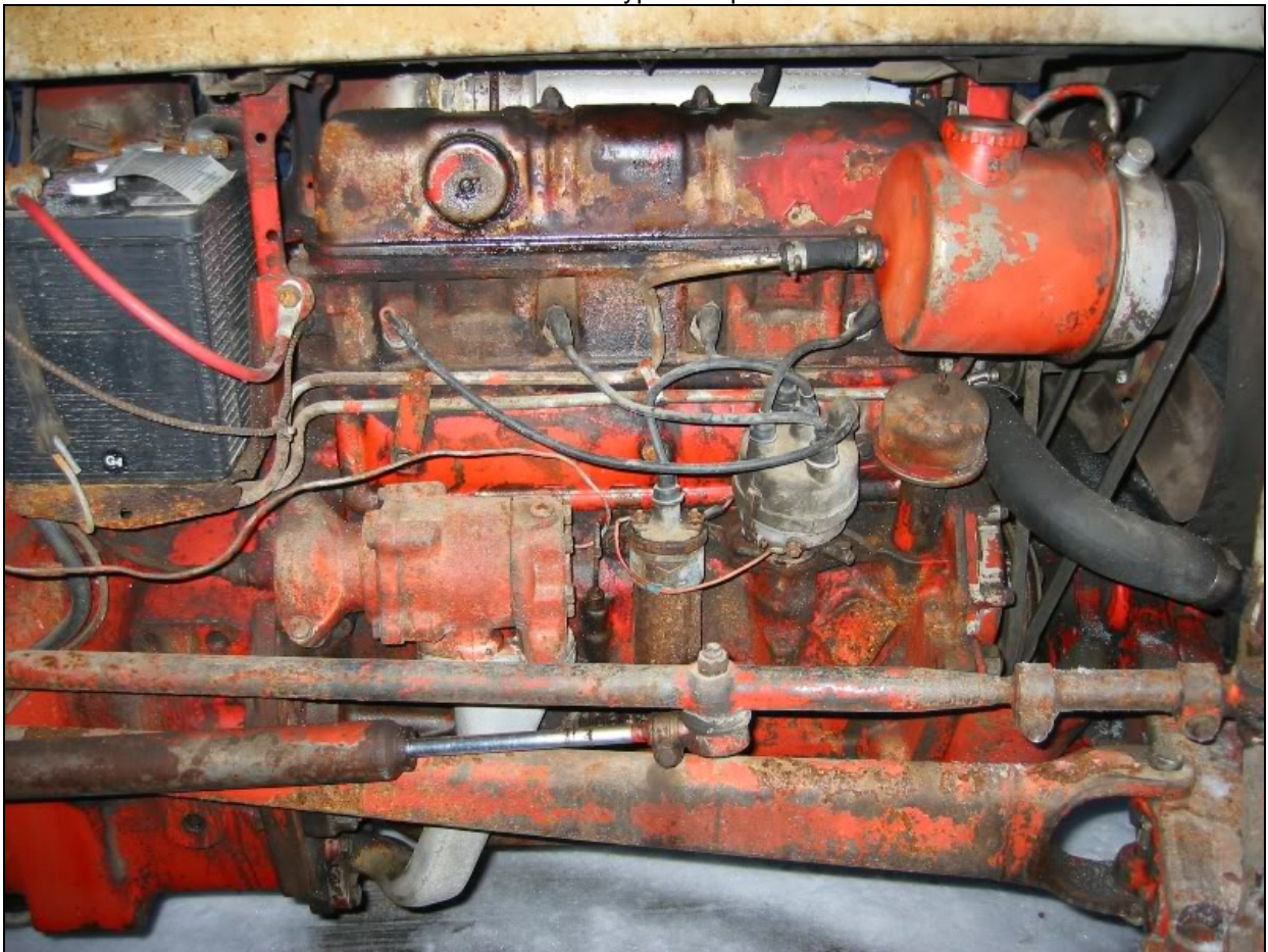
Sleeve Type Pump:

First off, there are two type of pumps used: Sleeve (a cylindrical unit with integrated reservoir) and a gear pump (traditional car type of pump with reservoir mounted on top). Examples are shown below.