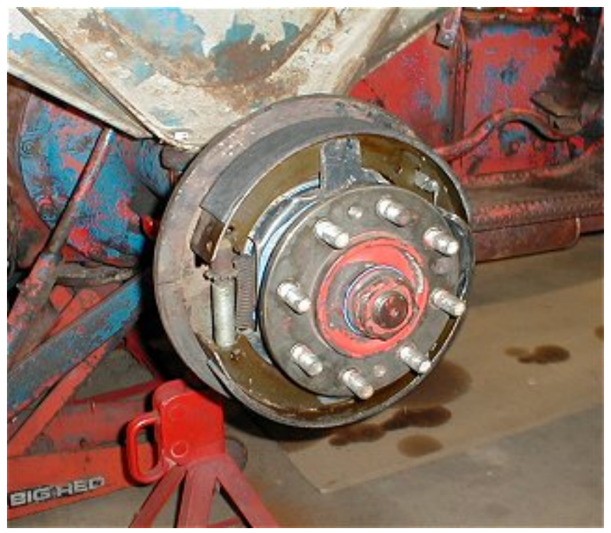
Finished and ready for the brake drum and wheel

Put the hub on and tighten the nut to hold it. Put the new, dry brake shoes on, install the drum, put the rear tire back on and finish by tightening the hub retaining nut REAL tight and replacing the wire clip. Adjust the brakes, and you should be leak free and stopping on a dime for the next several years.