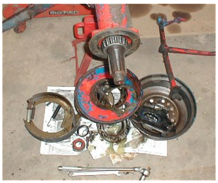
Disassembled and ready to clean

On early models, removing the backing plate and axle is somewhat unnecessary, but you should go this far anyway to reseal the area where grease can leak between the backing plate and axle housing flange and also make sure you have the right amount of shims to properly load the axle bearings.