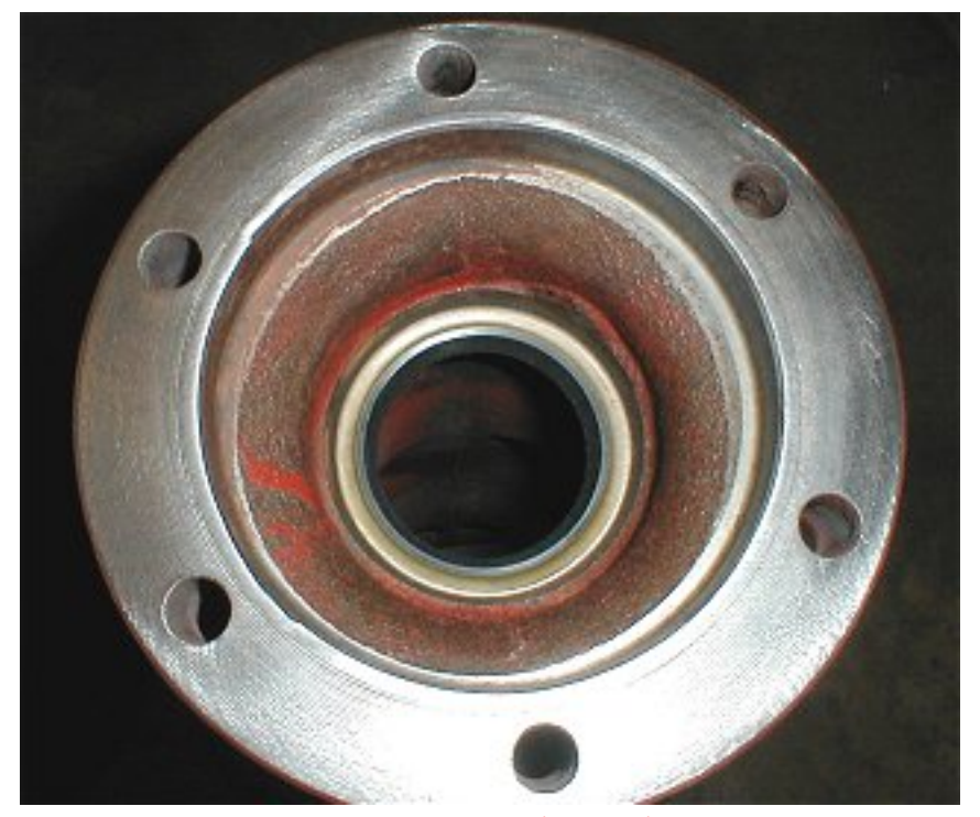
The inner seal on the '50 - '52 models

On early models, removing the backing plate and axle is somewhat unnecessary, but you should go this far anyway to reseal the area where grease can leak between the backing plate and axle housing flange and also make sure you have the right amount of shims to properly load the axle bearings.