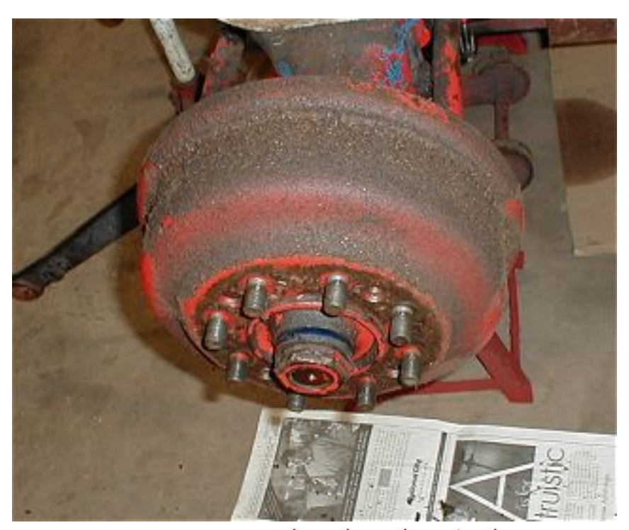
A common sight, the oil soaked rear brake drum on an 8N

Rear axle seals leaking gear lube onto the rear brake shoes and onto the wheel rim is very common on 8Ns, especially the early models before the added inner seal. The major causes of seal leakage are improper (loose) axle bearing preload and worn (loose) hubs on the axle shafts. Installing the correct number of shims to obtain proper bearing preload when replacing seals is critical, as is having good hubs. If your hubs were loose on the axles before, they will probably need replaced. Once the hubs get worn, they will no longer tighten against the taper splines on the axles and you'll never stop the leaks. I have very rarely had to replace an axle shaft - severe wear from loose hubs has always been in the hub itself and the harder axle shaft was still good. You may not be so lucky. Inspect the hubs and axle shafts closely for wear. If your hubs were tight on the axle and required some force to remove them, they are most likely ok. Replacing the seals is not too hard of a job if you're used to working on old rusty mechanical things and have some basic tools. Here's a short rundown. It's not meant to replace the I&T FO-4 shop manual for the 8N. You will need the manual on hand before you ever start replacing the seals. Refer to it as you go.