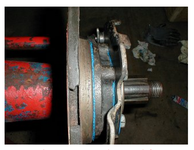
Sealer on every shim and face

I put a small bead of sealer around the axle shaft splines before sliding the hub back on to help keep the gear lube from leaking out the front side behind the nut. Wipe a little oil or grease on the inside lip of the new seal and around the seal diameter on the hub before the hub goes on. This keeps the seal from running dry on the hub and getting hot right away.