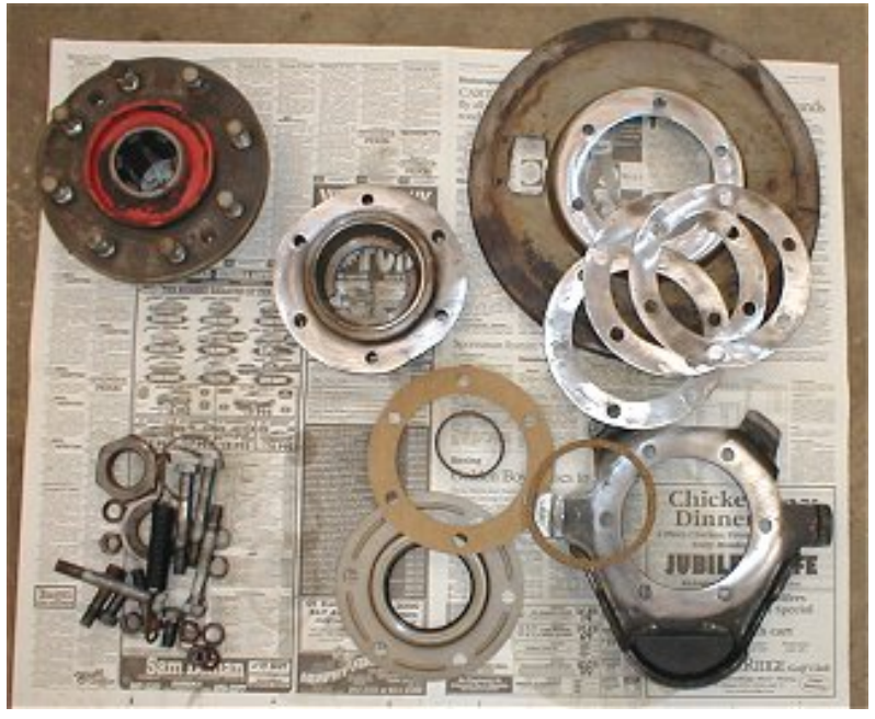
Cleaned up and ready to assemble

Be sure to pack the axle bearing with grease before you reassemble if you have the later model with inner seal. Clean all parts in a good solvent.