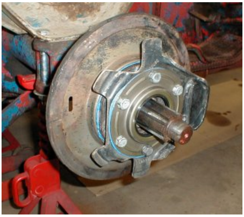
Putting it back together with the proper load

The 8N4284 cork gasket goes over the axle between the axle bearing and the hub. The 8N4225 cork gasket goes between the brake shoe pivot plate and the retainer/seal assembly. Use Ultra Blue there, too.