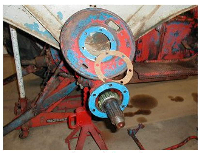
Use sealer on all flange faces

Reassemble with some Permatex Ultra Blue silicone RTV on all flange faces and wherever grease could leak out. The Permatex No.2 non-hardening form-a-gasket works fine, too. Use sparingly. Too much sealer just oozes out all over and is wasted as well as being ugly and possibly screwing up the bearing load you just worked so hard to set.