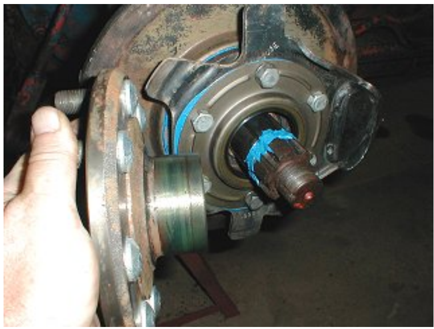
Installing the hub

I put a small bead of sealer around the axle shaft splines before sliding the hub back on to help keep the gear lube from leaking out the front side behind the nut. Wipe a little oil or grease on the inside lip of the new seal and around the seal diameter on the hub before the hub goes on. This keeps the seal from running dry on the hub and getting hot right away.