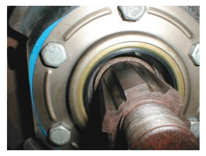
8N 4284 axle to hub cork seal installed