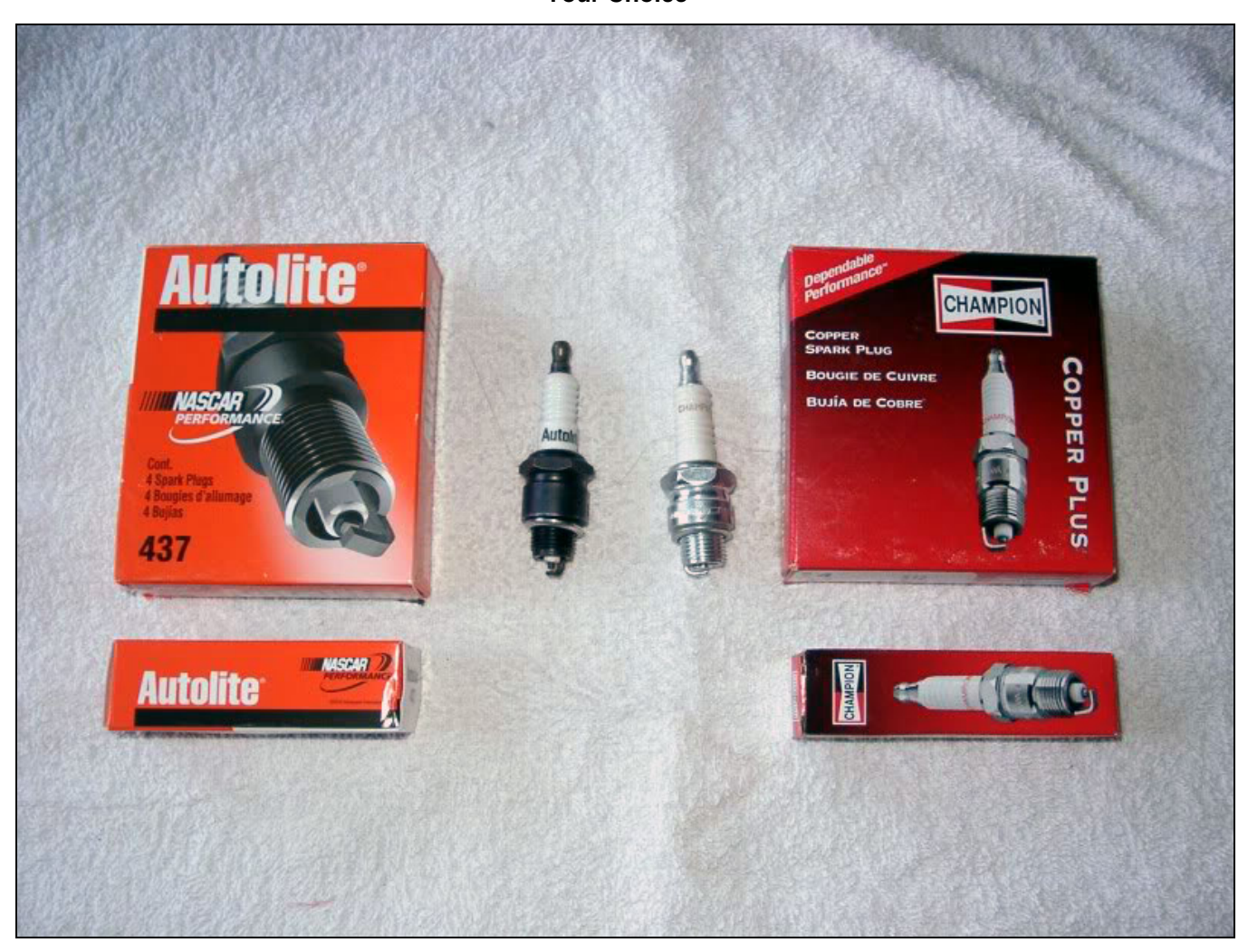
Your Choice -

Here's a quick identifier for which spark plug to use in your N-Series Tractor. The original Ford Operator's Manuals all call for the Champion 14mm H10 spark plug, which is still made and works fine. However, many Nowners prefer the hotter burning Champion H12 plug or the AUTOLITE 437 plug nowadays and they both also work fine. The Champion H12 plug is also listed as part number 512. There are probably a few other plugs out there that'll work, but these seem to all work without flaw. The Ford Spark Plug wrenches pictured show the very early 9N wrench (used in first month of tractor production) 81A-17017 with a Champion H10 plug; the replacement wrench, 01A-17017 with an AutoLite 437 plug; and the next generation replacement wrench, a Ford 01A-17017-B tool with a Champion H12 plug. I'd like to offer my advice when doing a tune-up and replacing your plugs. Get your air compressor fired up and blow off the top of the (cold) engine head where the plugs screw in to be sure all debris is cleared out before you unscrew the plugs. You don't need excess dirt and crud falling inside if you can help it. 14mm refers to the thread size and pitch of the plug. It is a METRIC thread so do not try a 1/2-20 tap or anything else other than a 14 millimeter by 1.25 (pitch) if you need to chase the threads in the head.