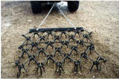
Figure 21. Chain harrow for compact tractor.

Chain harrows (Figure 21) are offered by several companies. They are popular for landscape use and are used in agriculture. They are flexible and do a good job of smoothing and leveling before sodding or seeding turfgrass. They are available in many widths and do not require a great deal of power. Most models are pulled from the drawbar. Some can be rolled up for storage or transport.