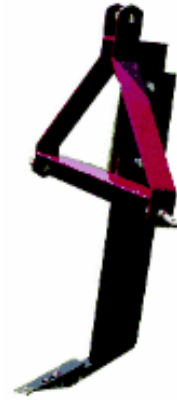
Figure 44. Subsoiler for compact tractor.

For additional information on compact tractors Additional information on compact tractors is available in LSU AgCenter Extension Bulletin #2906, Compact Tractor Selection, Use and Safety. It is available on the LSU AgCenter Web site ( www.lsuagcenter.com ).