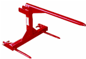
Figure 3. Bale spear for 3-point hitch on compact tractor.

Hauling bales on a compact tractor is a challenge and requires caution. A bale spear on the back will make a small tractor difficult to handle and can block visibility to the rear. Extra care is needed when using a bale spear on a front-end loader. Keep the load as low as possible, and drive slowly. If you must lift the load up high, be careful not to let the spear roll back. The bale could then roll down the loader arms and crush the driver. Always wear your seatbelt when hauling bales in case the tractor overturns.