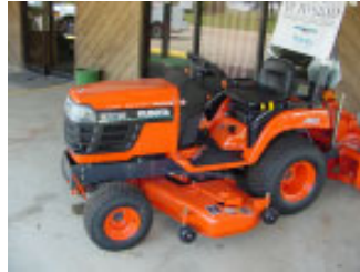
Figure 27. Mid-mount mower deck on subcompact tractor.

Mower – mid-mount Mid-mount decks are popular on the smaller compact utility tractors and on subcompact tractors (Figure 27). They tend to be more difficult to remove than rear-mount mowers, so they are more popular on the smaller tractors used primarily for mowing. On some current models of tractor, it is now possible to leave a mid-mount mower in place while using a front loader or a rear-mounted implement such as a tiller; nevertheless, operating other implements with a mid-mount mower in place can compromise performance of the other implements, and it certainly reduces ground clearance. Mid-mount decks generally provide good maneuverability and allow close trimming. Mid-mount mowers on compact tractors are usually ground-carried (they ride on the ground when in use and are merely pulled along by the tractor, whereas mid-mount mowers on lawn and garden tractors are usually suspended from the tractor with the cutting height controlled by the suspension linkage). Cutting height adjustment is made by moving the gage wheels up or down.