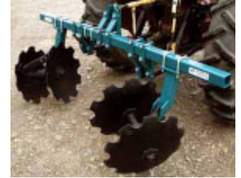
Figure 12. One-row disk bedder on compact tractor.

A disk bedder can be used for primary tillage (operated on ground that has not been previously worked with another implement) or secondary tillage (operated after some other operation such as plowing or disking). A disk bedder is an aggressive tool capable of slicing through plants or plant residue.