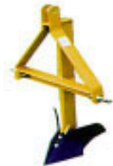
Figure 24. Middlebuster for compact tractor.

A middlebuster is generally harder to control than a disk bedder. It will tend to catch on roots, rocks or even hard clay and jerk the tractor to the side; a disk bedder will tend to ride over such obstacles. A middlebuster needs to be able to trip in some manner when it hits an immovable object. Most small, inexpensive middlebusters just have a pivot bolt and a second bolt in an open slot that allows the bottom to