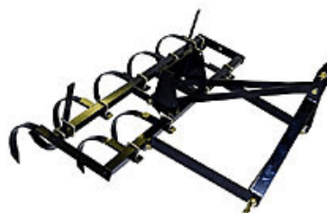
Figure 19. Spring-tooth harrow for compact tractor.

catch and then spring loose, thus vibrating and removing weeds. They also break up clods. Spring-tooth harrows are usually mounted on a 3-point hitch.