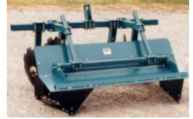
Figure 4. Bed shaper for compact tractor.

Bed shaper If you are using a compact tractor for farming or working a large garden, a bed shaper (Figure 4) is a useful implement. Most row crops in the Deep South, including garden crops, are grown on beds. Shaping the beds with a bed shaper helps to prepare a good, firm seedbed for planting or transplanting. A bed shaper will crush the clods while firming and smoothing the soil. A planter will run much better on a shaped bed.