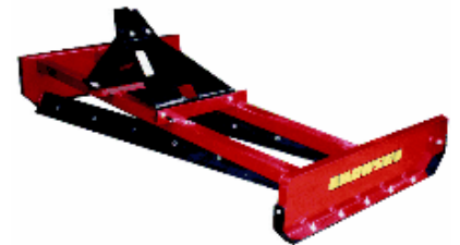
Figure 18. Grader blade for a compact tractor.

Grader blade A relatively new implement for compact tractors that is becoming increasingly popular is a grader blade, sometimes called a road scraper (Figure 18). Models from different companies offer somewhat different configurations, but generally have two or more angled blades mounted rigidly in a frame. They mount on a tractor 3-point hitch. They are used to drag and level gravel or dirt roads and driveways. They are easier and faster to use than an angle blade or a box blade. They are generally available in widths from 5 to 7 feet. It is important that the 3-point hitch be properly adjusted to keep the implement level. There are no moving parts to replace. Like any blade, there are different quality levels available; it is worthwhile to get