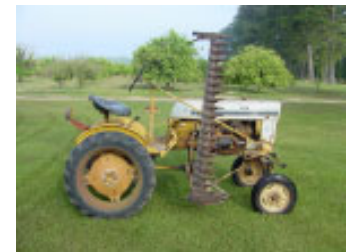
Figure 30. Sicklebar mower on small offset tractor.

The primary safety hazards with sicklebar mowers are sicklebar contact and entrapment in the powertrain. Although these mowers tend to be safer than rotary cutters, care in operation is still required.