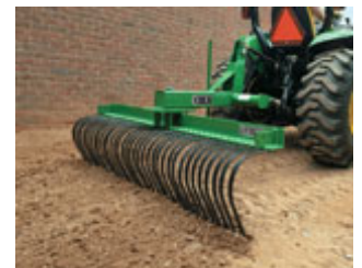
Figure 37. Landscape rake on compact tractor.

Rake – landscape A useful tool for landscape contractors is a landscape rake (Figure 37). These rakes are used primarily for preparing ground for seeding or sodding of turfgrass. They break up soft clods and can rake away hard clods. They lightly scratch the soil surface and leave just enough surface roughness to provide a good basis for seeding. Many landscape rakes are designed to allow them to be angled to the side – helpful in removing and windrowing rocks, trash or hard clods. A landscape rake should not be used to rake leaves, clippings or pine straw from turf. It is too aggressive and will damage the turf.