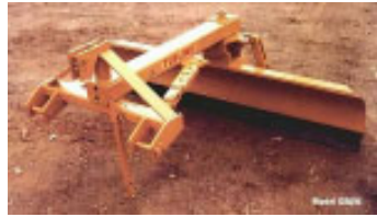
Figure 5. Angle blade for compact tractor.

Blade – angle One of the handiest implements you can put on a compact tractor is an angle blade (Figure 5). Of the several types of blades available, an angle blade is probably the most versatile. It can be used for leveling, moving small amounts of soil, cutting shallow ditches and back-dragging. Since it mounts to the 3-point hitch, it is easy to mount and remove.