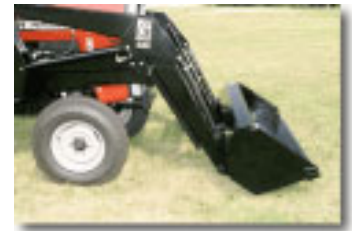
Figure 22. Front-end loader on compact tractor.

Loader One of the most popular implements for compact tractors is a front-end loader (Figure 22). A loader will allow you to dig, move soil or other bulk products, carry bags and other bulky items, lift equipment (using a chain), move hay bales, lift pallets and even do light grading. Not all compact tractors are equipped with the necessary hydraulic connections for a loader, so be sure you check on hydraulics if adding a loader to an existing tractor. Some manufacturers now offer front-end loaders that are much easier to attach and remove (once initially mounted) than in the past, making it more practical to remove a loader when you don't need it. A loader for a compact tractor may cost $2,000-$3,000, depending on size and quality. In most cases, a loader made by the tractor manufacturer will cost more, but it should fit better and will be designed specifically for your tractor model.