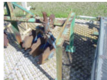
Figure 13. Homemade frame to support disk bedder or similar implement.

Hitching, unhitching and storage of disk bedders is a problem since they will not stand up by themselves when unhitched. Simply leaning the implement against a post or tree is not safe; it could fall on someone. If you must lean an implement like this against a tree or post, tie or chain it to the tree or post so it can't fall over. It is possible to build a simple frame to support a disk bedder (or any similar implement) (Figure 13). A frame like this is much safer and makes hitching and unhitching much easier.