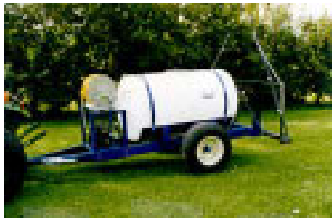
Figure 41. Trailer sprayer for compact tractor.

Pendulum-action spreaders should give a symmetrical pattern with all products without the need for any pattern adjustment. It is still necessary to determine the effective swath width, either by testing or from the bag label. Pendulum spreaders can also be used for