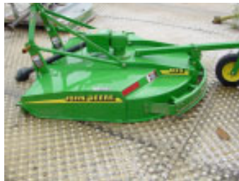
Figure 29. Rotary cutter for compact tractor.

Mower – rotary cutter A rear-mounted rotary cutter (Figure 29) is often referred to as a Bush Hog 7 - equivalent to referring to all soft drinks as Cokes. These mowers have a single blade (in the sizes used on compact tractors) and are designed for heavy, rough cutting. They are not designed to mow grass as short as is common for lawns and should not be set to cut lower than about 3 inches. They will cut light brush (1 to 2 inches in diameter, depending on model). They are not highly maneuverable because of their length. Cutting height is adjusted by moving both the rear gage wheel and the 3-point hitch on 3-point hitch models. Pull-type models with two wheels are available but less common. Both types are easily attached and removed. Widths of 4 to 6 feet are common with compact tractors.