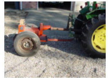
Figure 15. PTO generator on compact tractor.

Because the generator is not 100% efficient, you will probably not be able to actually deliver quite that much power. On the other hand, you can always buy a generator that is rated a little too large for your tractor,