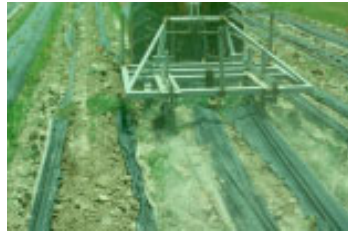
Figure 33. Plastic mulch lifter on compact tractor.

Plastic mulch lifter The use of plastic mulch is a common practice for strawberry and vegetable growers and for some home gardeners, but there are two major problems with plastic mulch: it is expensive to install and at some point it has to be removed from the field. Several machines can help simplify the removal of the mulch (Figure 33).