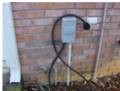
Figure 17. Large cord and plug to connect house transfer switch to PTO generator.

Maintenance on a PTO generator is pretty simple: keep it sheltered and out of the weather, be sure the tires are aired up (unless permanently mounted on a pad or mounted on a 3-point hitch), and grease any fittings on the powershaft or other drive components.