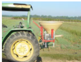
Figure 42. Pendulum-action spreader on compact tractor.

banding fertilizer. With a shortened spout, they can throw two bands on opposite sides of the tractor with the spacing between bands determined by spout length, PTO speed and spout height. If the spout is removed and a splitter box mounted, they can drop bands of fertilizer for sidedressing row crops.