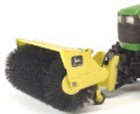
Figure 8. Rotary broom on compact tractor.

Chipper/shredder Small engine-driven chipper/shredders are popular with homeowners. Many commercial maintenance contractors use large engine-driven chippers towed by trucks. There is a category in the middle that works well with compact tractors. Many companies make mid-sized PTO-powered chipper/shredders (Figure 9) that mount on the 3-point hitch of a