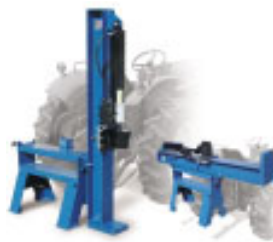
Figure 23. Log splitter for compact tractor.

Splitting force is a factor of both hydraulic pressure and cylinder diameter. Because of the high pressure available on tractors, the cylinders may not need to be as large on tractor units as on units powered by a small engine. Operating speed is determined by hydraulic flow rate and cylinder size. The smaller the cylinder, the faster the cycle time. Thus, it is desirable to use the smallest cylinder that will