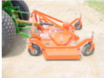
Figure 25. Heavy-duty finishing mower on compact tractor.

Mower – finishing Finishing mowers (Figure 25) are also called grooming mowers. Finishing mowers have decks that are virtually the same as the decks on mid-mount mowers. They typically have three blades. Height is controlled by four gage wheels (two wheels on cheap models). These mowers vary greatly in quality with corresponding price differences. This is a case where it is worthwhile to buy a high-quality mower with a heavy deck, four heavy gage wheels, heavy frame and heavy power transmission components. The better models use separate belts to drive the outer blades and eliminate the need for a back-side idler on the drive belt; this dramatically improves belt life. Finishing mowers can provide cut quality equal to mid-mount mowers. They work well for mowing open areas, but they are difficult to maneuver around trees or other obstacles. They are easily attached and removed. They are not designed to cut tall, weedy grass. They have multiple gage wheels and rollers that allow a relatively low cutting height with minimal scalping.