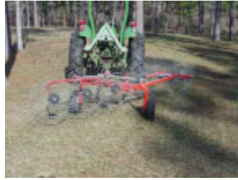
Figure 38. Rake for lawns and pine straw on compact tractor.

The widths available in rotary tillers for compact tractors run from about 3 to 5 feet. Since rotary tillers typically require 10-15 hp per foot of width if operated at full depth and normal operating speed, a compact tractor cannot handle a large tiller. Some smaller compact tractors are not capable of handling a tiller that