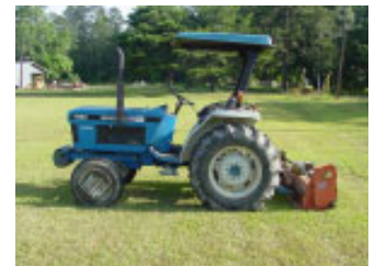
Figure 26. Flail mower on compact tractor.

Mower – flail Flail mowers (Figure 26) are often used by highway mowing and park maintenance crews because they are somewhat less likely to throw objects. On a flail mower, the blades are free-swinging and rotate around a horizontal axis. The cut from a flail mower is