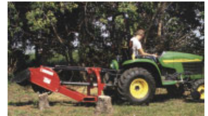
Figure 43. Stump grinder mounted on compact tractor.

Stump grinder A few companies manufacture stump grinders that mount on a tractor 3-point hitch and are powered by the tractor's PTO (Figure 43). These stump grinders are not as versatile as dedicated stump grinders, but they are much less expensive and are adequate for occasional use by a contractor, farmer or rural homeowner. They require a compact tractor with at least one remote hydraulic outlet, and some require two hydraulic outlets.