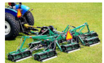
Figure 28. Reel mower

Mower – reel Reel mowers are much less common than other mowers, but gang reel mowers (Figure 28) are available for compact tractors. Reel mowers are used primarily where a high cutting quality and low cutting height are required such as golf courses, athletic fields, parks and sod farms. Pull-type gang reel mowers can be ground driven or driven by a hydraulic motor on each unit. Reel mowers will not cut tall or tough grass and