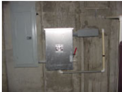
Figure 16. Transfer switch for safe switching between line power and

NEVER CONNECT TO A HOME SERVICE ENTRANCE WITHOUT GOING THROUGH AN APPROVED DOUBLE-POLE DOUBLE-THROW TRANSFER SWITCH! This switch (Figure 16) will completely disconnect the home service entrance box from the utility's power lines when the generator is connected and vice versa. This is essential to avoid your generator feeding current back into the utility line and risking killing a utility lineman who is repairing the line. It also prevents utility power feeding back into your generator when the line power is restored. Consult your utility company and use only an approved transfer switch and have the installation approved by the utility company. People's lives depend on it! You can then wire up a cable from your transfer switch to connect to the generator (Figure 17).