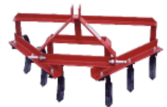
Figure 10. 1-row row-crop cultivator for compact tractor.