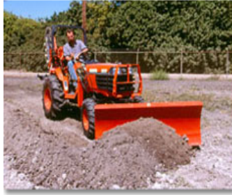
Figure 7. Front blade on compact tractor.

Broom – rotary A rotary broom can be attached to the front of a tractor similar to the way a front blade is attached (Figure 8). These powered rotary brooms are useful for cleaning hard surfaces – roads, driveways, parking lots. They are often used in the North for removing light snow. This implement would be of little value to most farmers or homeowners, but it might be of value to a contractor. Many widths and brush diameters are available. The drive can be mechanical or hydraulic. The broom is usually run at an angle so material is swept to the side.