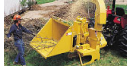
Figure 9. PTO chipper on compact tractor.

Cultivators are available in many configurations including rigid shank, spring tine, sweep, point, rolling and indi-