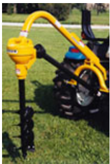
Figure 36. Post hole digger for use on compact tractor.

Post hole digger Digging post holes is a common job for compact tractors. Many companies make post hole diggers that mount on the 3-point hitch of a compact tractor (Figure 36). They are powered by the tractor's PTO. Rural homeowners use post hole diggers for setting fence posts, and landscape contractors use them for both fence posts and for planting trees and shrubs. Augers are usually sold separately from the digger head and are available in sizes from 4 inches to 12 inches. Augers for tree planting are available in sizes to 30 inches, but the larger sizes are usually intended for larger tractors.