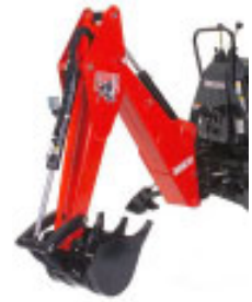
Figure 2. Backhoe for compact tractor.

Backhoe A backhoe is one of the most expensive attachments, but they are fairly popular. Backhoes (Figure 2) mount on the rear of a compact tractor but often do not use the 3-point hitch, or at least not the standard upper arm. They are usually rigidly mounted on the rear of the tractor. Because they require a high flow rate of hydraulic oil, they typically have their own hydraulic pump that mounts on the tractor PTO. Backhoes have four primary hydraulic functions (swing, inner boom, outer boom and bucket curl) plus hydraulic actuation of the stabilizers. In purchasing a backhoe, you will have two choices in controls: two lever and four lever (plus two levers for the stabilizers). Older operators who have used four-lever controls in the past may prefer that style, but the newer two-lever designs are generally easier to learn to use and becoming popular.