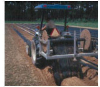
Figure 34. Plastic mulch collector on compact tractor.

Some use a belt drive to the spool and allow the belt to slip to maintain constant tension on the plastic. Others have a variable-speed valve in the hydraulic line to the spool motor that must be manually adjusted (constantly) by an operator riding on the machine. A design developed by the LSU AgCenter (Figure 34) senses the tension on the plastic and automatically adjusts spool speed to provide relatively uniform torque loading on the spool. An entirely different design uses rollers to feed the plastic sheet into a big wire cage instead of rolling it up.