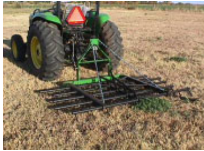
Figure 20. Spike-tooth harrow for compact tractor.

Spike-tooth harrows (Figure 20) are relatively rigid tools that are not as aggressive as spring-tooth harrows. Spike-tooth harrows are usually available in sections about 4 feet wide. They can be ganged on a bar as shown in Figure 20 to provide a wider working width. They can be pulled from the drawbar or mounted on a 3-point hitch. A drawbar hitch is less expensive, but it complicates transport. The angle of the teeth can be adjusted from vertical to angled back almost flat. The more vertical the teeth, the more aggressive the action.