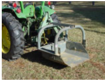
Figure 11. Dirt scoop on compact tractor.

Dirt scoop A dirt scoop (Figure 11) is a handy attachment for small tractors. It will allow you to dig, move and dump small quantities of soil, gravel, sand or other materials much easier than you can do with a shovel and wheelbarrow and much less expensively than with a front-end loader on your tractor. A dirt scoop may be called by other names such as a rear bucket, slip bucket or slip scoop. It mounts on the 3-point hitch of a tractor. It is raised and lowered by the tractor, and usually has a manual dump, triggered by pulling a rope. The scoop or bucket can be reversed (by hitching to either end), thus allowing you to dig in either forward or reverse, depending on the requirements of a given project. The normal mode of action is to scoop up a load of material in the bucket, haul it wherever needed and dump it.