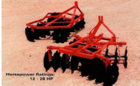
Figure 14. Disk harrows for compact tractors.

Disk harrow Although moldboard plows are used for primary tillage in more northern areas, a disk harrow (Figure 14) is frequently the primary tillage tool of choice in the South. Disk harrows are available in several configurations: single, tandem and offset. The most common disk harrow for use with a compact tractor is the tandem disk that has four gangs as shown in Figure 14. The front gangs throw soil out, and the rear gangs move it back toward the center. The angle of the individual gangs can be changed to make the disk more aggressive; the greater the angle, the more aggressive the disk.