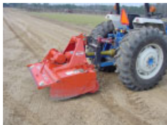
Figure 39. Heavy-duty rotary tiller on compact tractor.

matches the full width of the tractor, thus the tiller must be offset to one side and will thus till up wheel tracks on only one side. Some tillers have a fixed offset; others can be shifted to the side or centered.