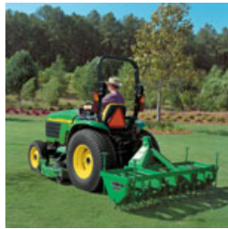
Figure 1. Turf aerator on compact tractor.

Dethatchers are similar machines, but generally use spring tines to rake up thatch rather than slicing or puncturing the thatch and soil. Some machines have two kinds of tines to perform both operations. The overall purpose of these machines is to reduce thatch in turfgrass.