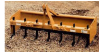
Figure 6. Box blade for compact tractor.

Blade – box A box blade (Figure 6) is useful around building and landscape construction sites or anywhere loose material such as soil or gravel needs to be moved short distances. Box blades have blades on the front and back side of the rear of the box, thus they can push or pull soil; however, they can only constrain soil in the box when moving forward. Most box blades have ripper teeth on the front toolbar that can be adjusted for depth or lifted out of the way. The teeth allow you to break up hard soil before scraping. On some heavy-duty box blades, the teeth can be rotated up and down with a hydraulic cylinder, but, on most box blades sold for compact tractors, the teeth are manually adjusted with mechanical latches.