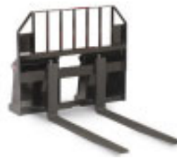
Figure 31. Pallet forks to fit front-end loader on compact tractor.

Pallet forks There are several ways to handle pallets with a compact tractor. The most common way is with a pallet fork attachment (Figure 31) to replace the bucket on a front-end loader. Maneuvering forks in this configuration is more awkward than with a dedicated fork lift,