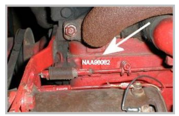
Early NAA serial number location

Serial number location on the first 22,238 NAA models was on the left front of the engine block just below the head as shown in the photo below.