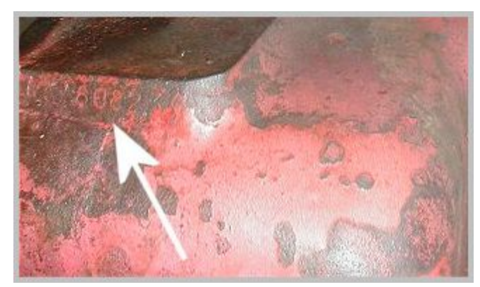
Later NAA serial number location

Serial number location on later NAA models was on the left side of the transmission case just below the flat above the starter bulge as shown in the photo below.